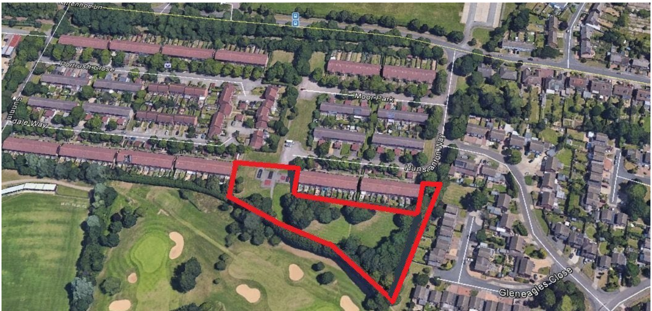
Size approximately Sq m 4500 Acres 1.11

This open space, comprises a large expanse of grass with a variety of trees and shrubs, located close to dense housing.