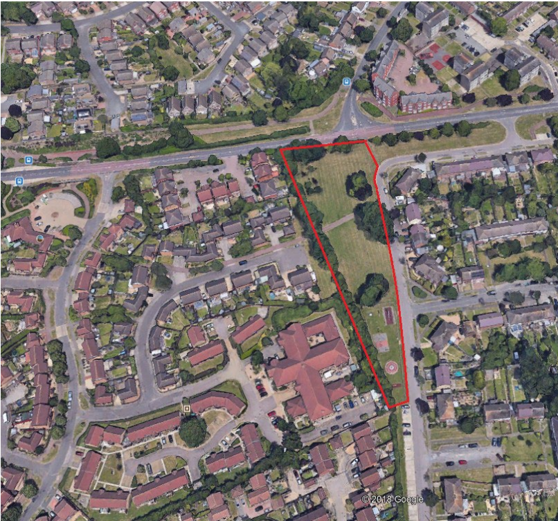
Size approximately Sq m 4590 Acres 1.13

This open space features a mix of grass, trees and hedges and is located close to dense housing. The site incorporates a popular children's play area with a range of play equipment.