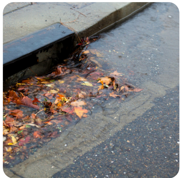
Dead leaves blocking a drain