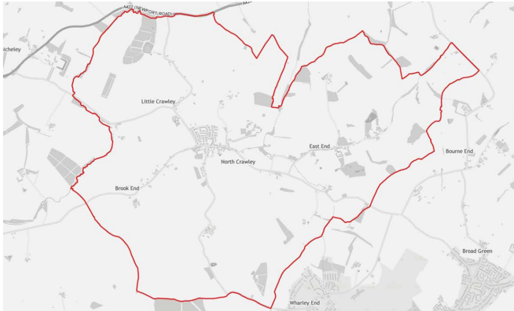
Figure 1: Designated Neighbourhood Plan Area (North Crawley Parish)