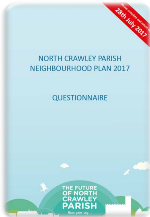
Questionnaire circulated in July 2017