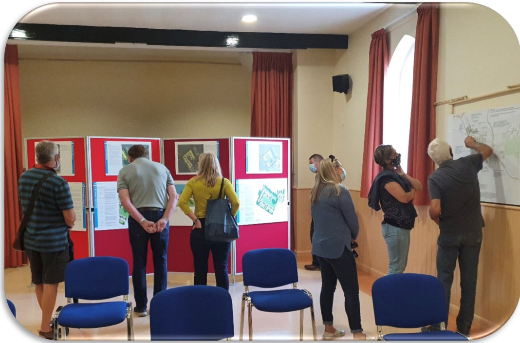
Neighbourhood Plan consultation event July 2021