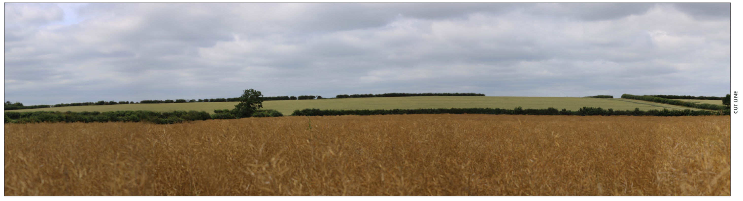
PANORAMA OF VIEWPOINT L3 ILLUSTRATING CONTEXT VALUE: MEDIUM VIEW SOUTH-WEST ON FOOTPATH 4, WHICH CONNECTS TO MOULSOE. IN THIS VIEW, WITHIN THE MOULSOE BOWL THE OUTER FACING SITE SLOPES OF THE MOULSOE RIDGE FORM PART OF THE SKYLINE.