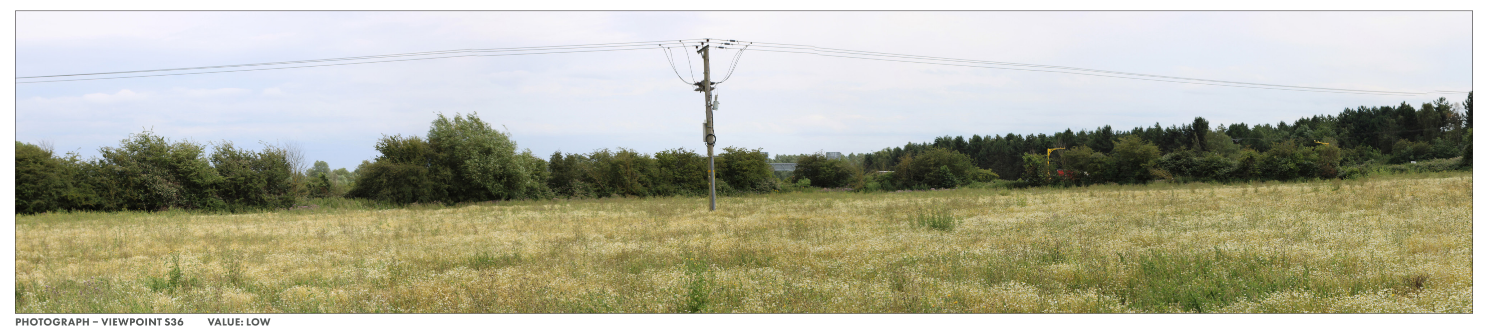
VIEW LOOKING SOUTH-EAST TOWARDS PART OF THE SITE'S SOUTH-WESTERN BOUNDARY FROM FOOTPATH 14 THAT LINKS MILTON KEYNES AND NEWPORT PAGNELL. ROUGH GRASSLAND, RUDERALS AND SCRUB DOMINATE THIS FLAT FIELD. VIEWS EXTEND TO THE M1 CORRIDOR AND ADJACENT VEGETATION