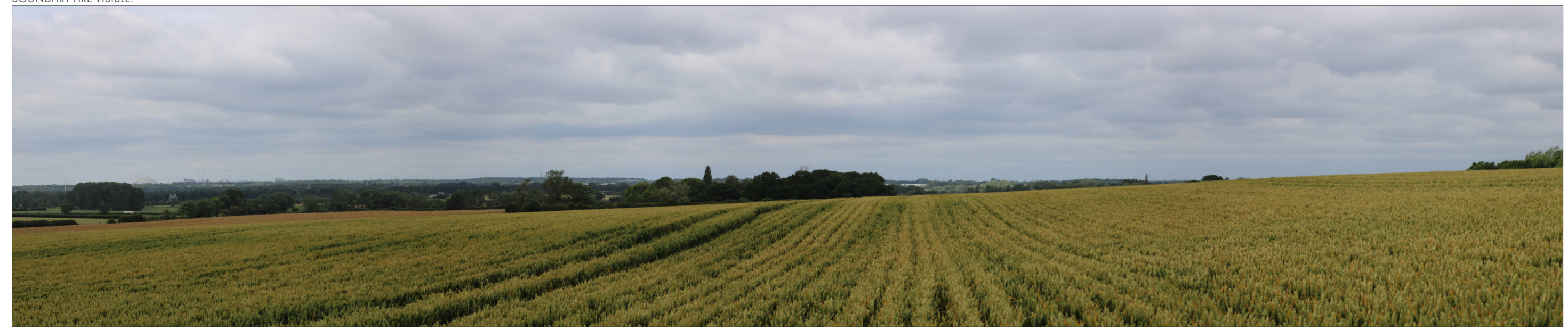
PHOTOGRAPH - VIEWPOINT $26 VALUE: MEDIUM VIEW LOOKING SOUTH-WEST FROM FOOTPATH 17, WHICH JOINS BRIDLEWAY 3 TO MOULSOE. FROM THIS ELEVATED POSITION, DISTANT VIEWS OF MILTON KEYNES ARE SEEN IN THE DISTANCE WITH THE SNOWDOME BREAKING THE SKYLINE.

VIEW LOOKING SOUTH-EAST FROM FOOTPATH 17, WHICH JOINS BRIDLEWAY 3 TO MOULSOE. VIEWS EXTEND FROM THE TICKFORD RIDGE OVER THE MOULSOE GAP TO MOULSOE. IN THE MIDDLE DISTANCE THE MOULSOE RIDGE AND A WOODLAND COPSE ON THE SITE'S NORTH-EASTERN BOUNDARY ARE VISIBLE.