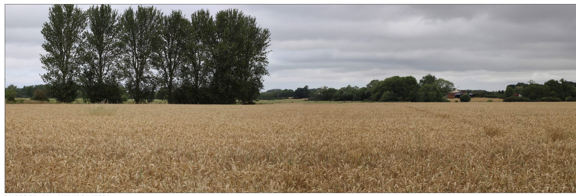
PHOTOGRAPH - VIEWPOINT $34 VIEW LOOKING SOUTH-EAST TOWARDS HEDGEROW ALONGSIDE THE A509 LONDON ROAD CORRIDOR. A LARGE FIELD OF PASTURE DOMINATES THE VIEW. COTTAGES SOUTH OF MOULSOE BUILDINGS FARMHOUSE ARE SEEN TO THE LEFT.