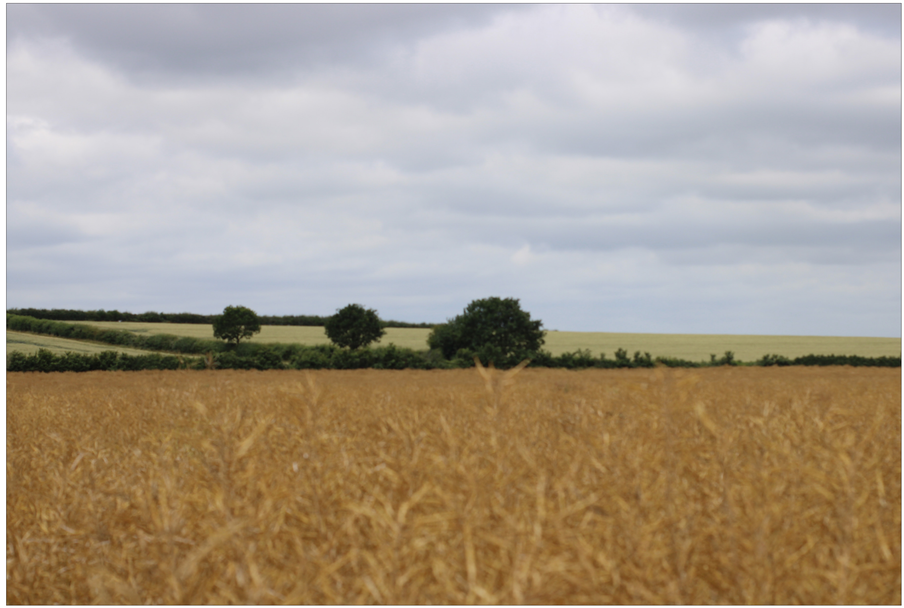
PHOTOGRAPH - VIEWPOINT L3