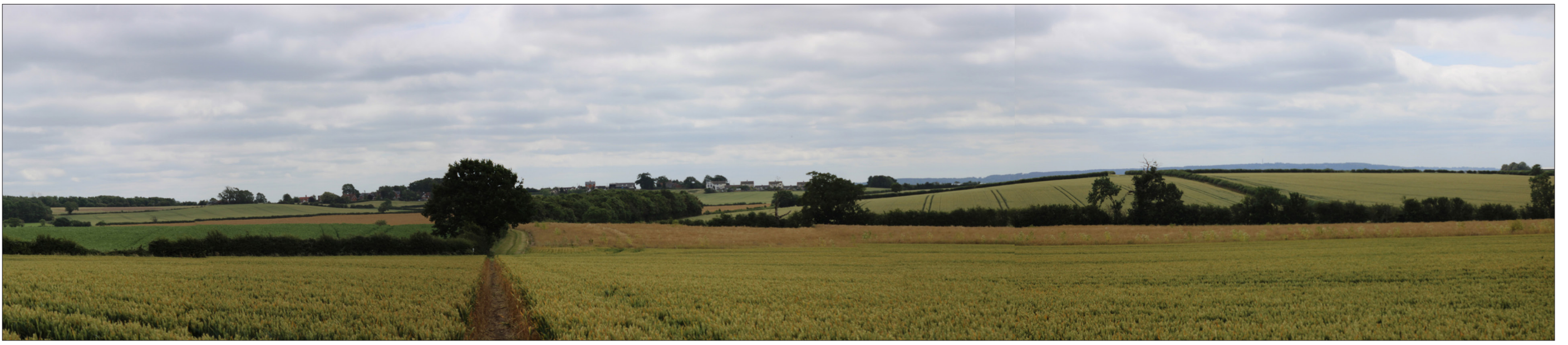
PHOTOGRAPH - VIEWPOINT $25 VALUE: MEDIUM

VIEW LOOKING SOUTH-EAST FROM FOOTPATH 17, WHICH JOINS BRIDLEWAY 3 TO MOULSOE. VIEWS EXTEND FROM THE TICKFORD RIDGE OVER THE MOULSOE GAP TO MOULSOE. IN THE MIDDLE DISTANCE THE MOULSOE RIDGE AND A WOODLAND COPSE ON THE SITE'S NORTH-EASTERN BOUNDARY ARE VISIBLE.