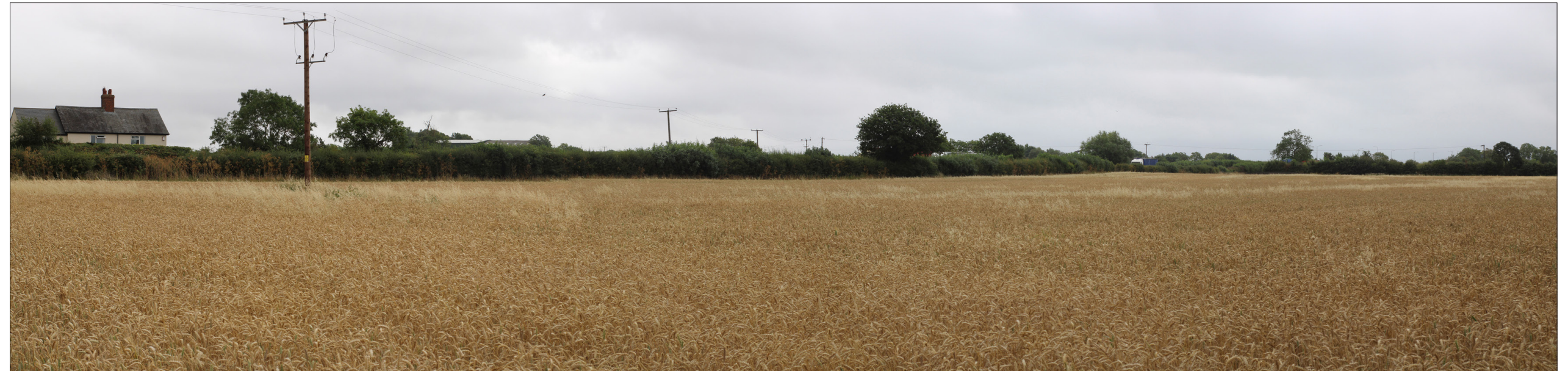
PHOTOGRAPH - VIEWPOINT $33

PHOTOGRAPH – VIEWPOINT $32 VIEW LOOKING NORTH. THE VEGETATION AND TREE LINED CORRIDOR OF THE RIVER OUZEL IS APPARENT WITH FIELDS OF PASTURE IN THE FOREGROUND AND TO THE WEST.