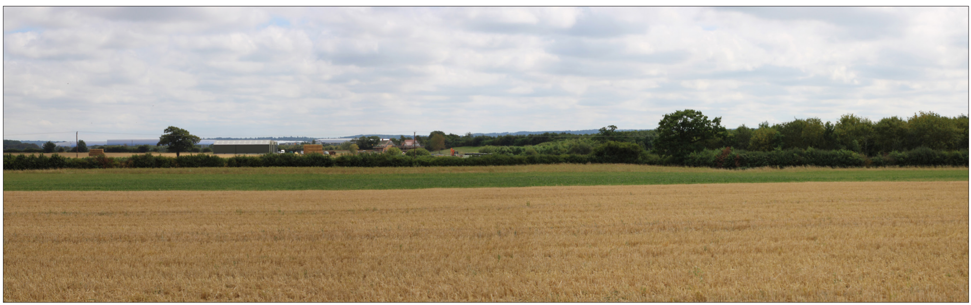
PHOTOGRAPH - VIEWPOINT S7

VIEW LOOKING SOUTH-EAST FROM THE SOUTH-EASTERN EDGE OF THE SITE. BEYOND THE SITE'S BOUNDARY VIEWS EXTEND TO BROUGHTON FARM, RESIDENTIAL DEVELOPMENT AND DISTRIBUTION SHEDS ON THE EASTERN EDGE OF MILTON KEYNES. VIEWS OF THE M1 CORRIDOR ARE TRUNCATED BY BUNDING AND PLANTING.