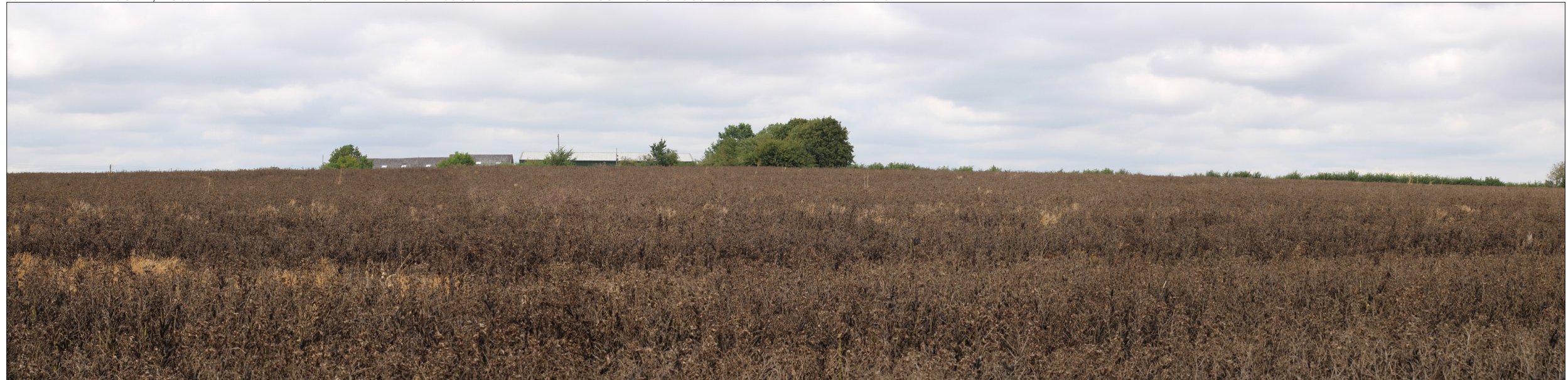
PHOTOGRAPH - VIEWPOINT S12

PHOTOGRAPH – VIEWPOINT S11 VIEW LOOKING SOUTH WEST FROM WITHIN THE SITE TOWARDS THE SOUTH-WESTERN BOUNDART WITH THE M1. THE LANDFORM IS PREDOMINANTLY FLAT AND SLOPES GENTLY TO THE SOUTH. AN ARABLE FIELD DOMINATES THE FOREGROUND. MOVING VEHICLES AND MOTORWAY SIGNAGE ARE VISIBLE WITHIN THE LANDSCAPE, HOWEVER THE VEGETATION AND LANDFORM ASSOCIATED WITH THE M1 CORRIDOR OBSCURES VIEWS OF MILTON KEYNES.