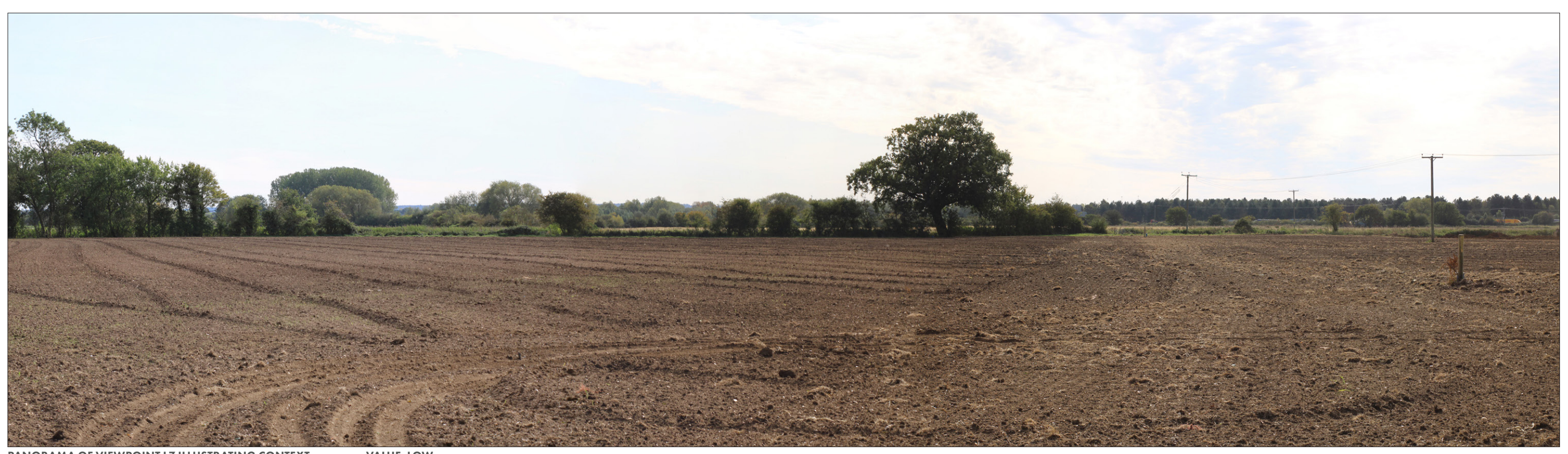
PANORAMA OF VIEWPOINT L7 ILLUSTRATING CONTEXT VALUE: LOW VIEW SOUTH FROM FOOTPATH 14, WHICH CONNECTS MILTON KEYNES AND NEWPORT PAGNELL. VIEWS OVER AN OPEN ARABLE FIELD, WHICH FORMS PART OF THE WIDER ALLOCATION EXTEND TO PART OF THE SITE'S NORTH-WESTERN BOUNDARY. BEYOND THE SITE, VEGETATION ASSOCIATED WITH THE M1 CORRIDOR IS VISIBLE.