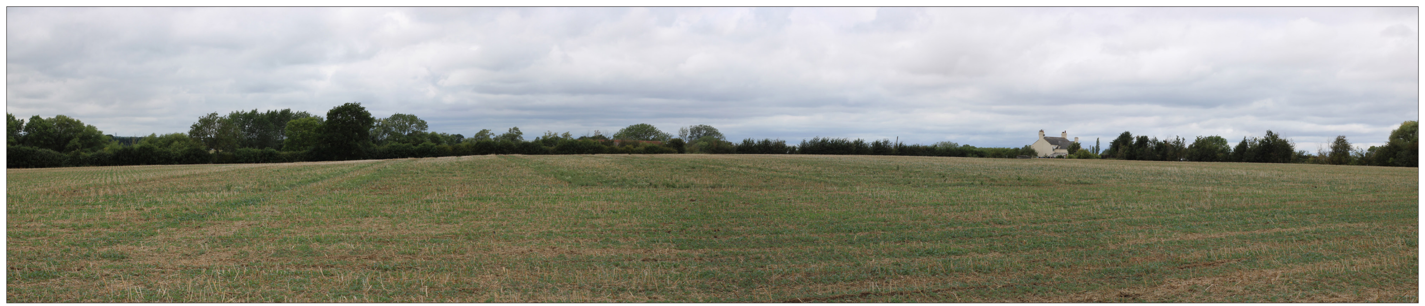
PHOTOGRAPH - VIEWPOINT $19

VIEW LOOKING WEST. ARABLE FIELDS EXTEND TO VEGETATION ALONGSIDE THE A509 LONDON ROAD. FARM COTTAGES AT 27 AND 29 LONDON ROAD ARE SEEN TO THE RIGHT.