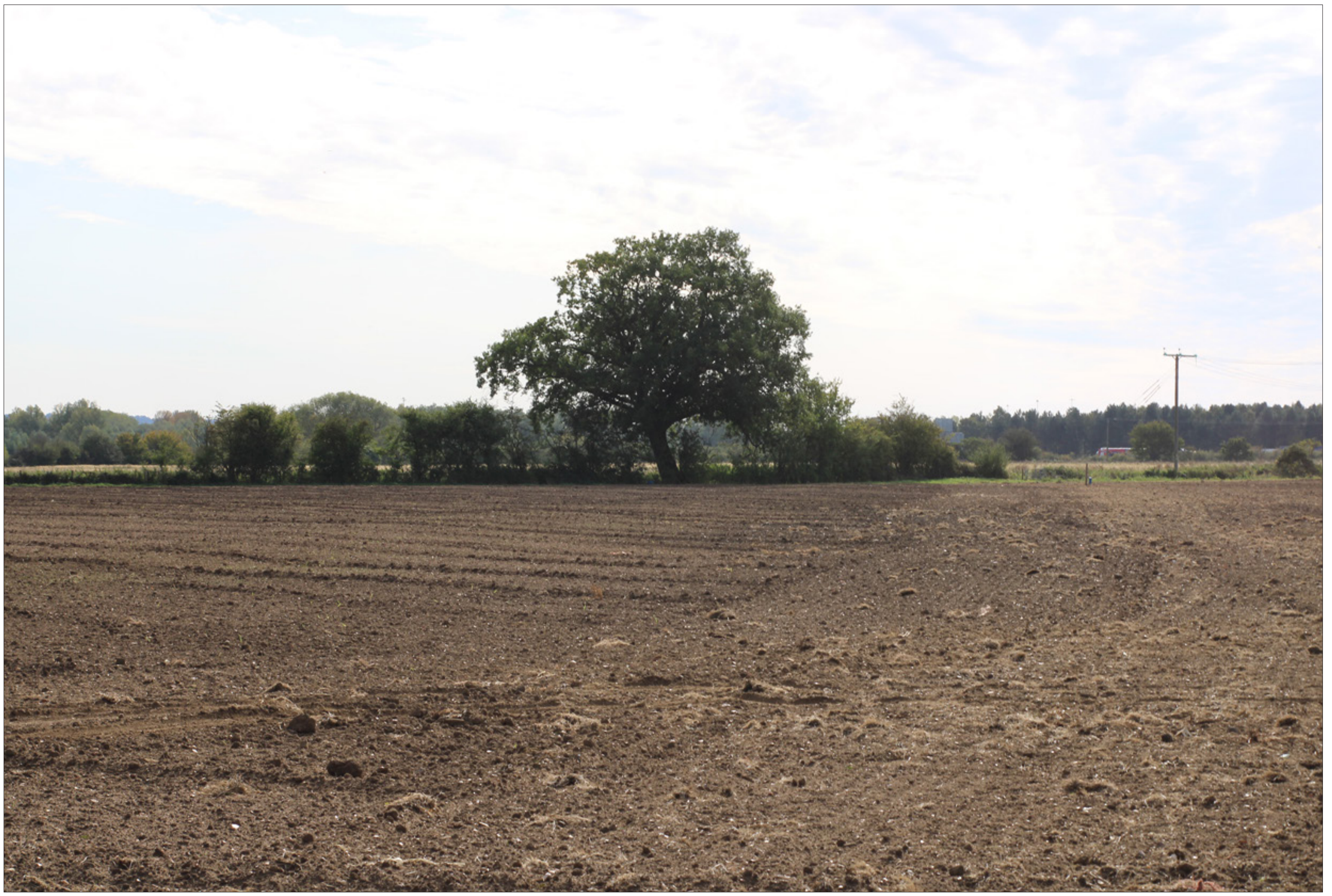
PHOTOGRAPH - VIEWPOINT L7