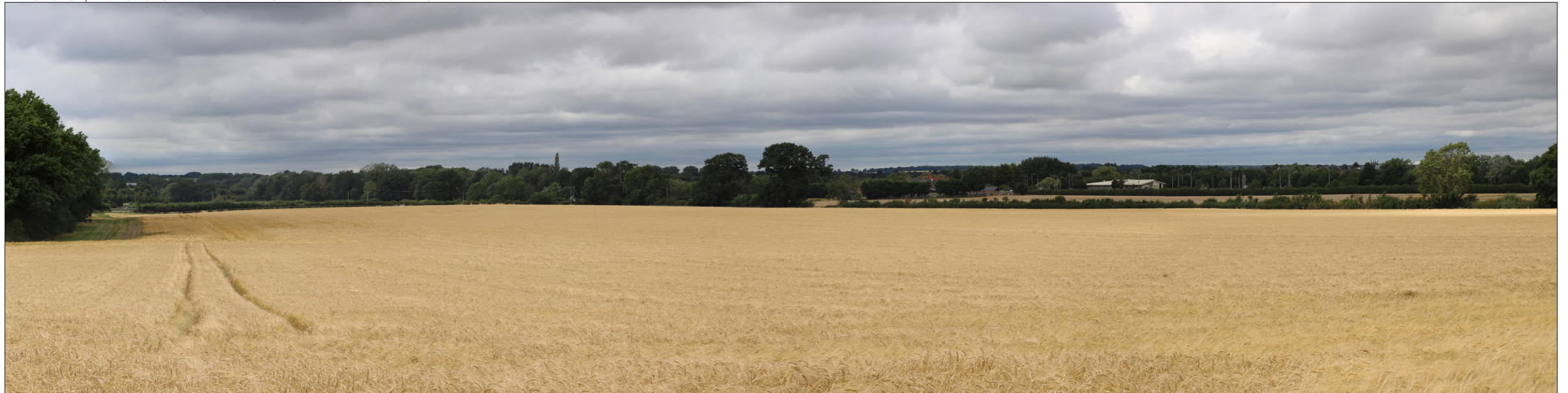
PHOTOGRAPH - VIEWPOINT $21

PHOTOGRAPH - VIEWPOINT 520 VIEW LOOKING SOUTH EAST. FROM THIS ELEVATED POSITION AT THE END OF THE TICKFORD RIDGE VIEWS EXTEND BEYOND THE MOULSOE GAP TO MOULSOE. FROM LEFT TO RIGHT THE VIEW INCLUDES THE OLD SCHOOL HOUSE AND ADJACENT BUILDINGS; ST. MARY'S CHURCH WITH PROPERTIES NORTH OF THE CHURCH; AND CHURCH FARM WITH PROPERTIES TO THE NORTH OF THE FARM.