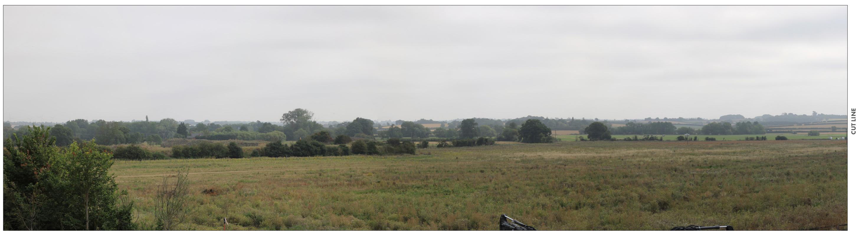
PANORAMA OF VIEWPOINT L6 ILLUSTRATING CONTEXT VALUE: LOW VIEW EAST FROM WILLEN ROAD BRIDGE CROSSING THE M1 MOTORWAY. VIEWS OF THE SITE EXTEND OVER THE VALLEY FLOOR TO WEST FACING SLOPES. MOULSOE IS VISIBLE IN THE FAR DISTANCE.