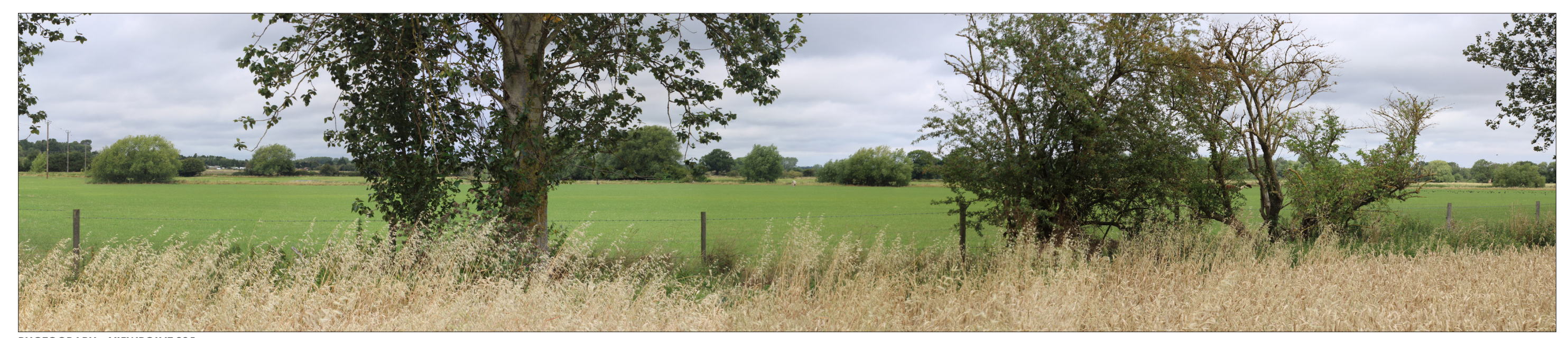
PHOTOGRAPH - VIEWPOINT $35 VIEW LOOKING NORTH-WEST BEYOND THE LINE OF POPLARS. FIELDS OF PASTURE ARE PUNCTUATED BY VEGETATION ALONGSIDE THE OUZEL.