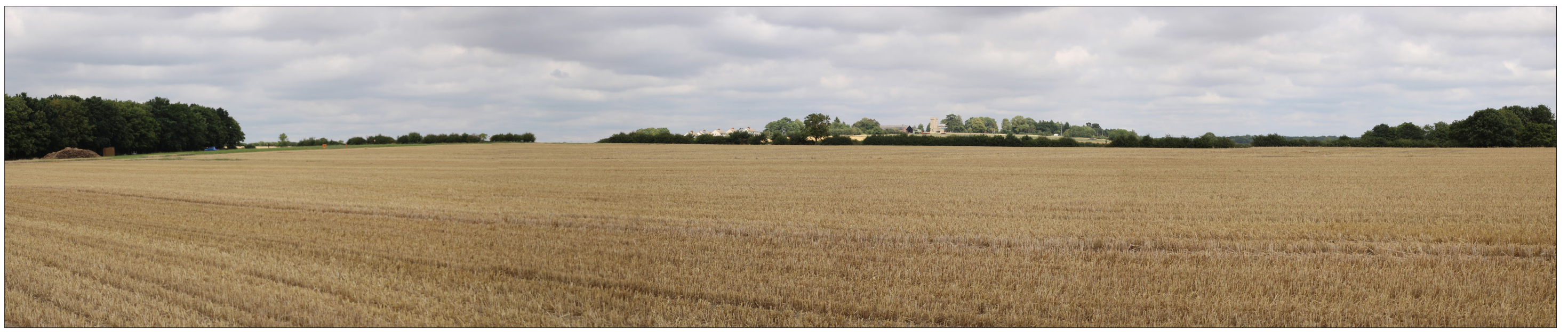
PHOTOGRAPH - VIEWPOINT $10

VIEW LOOKING NORTH-EAST FROM WITHIN THE SITE. ARABLE LAND DOMINATES THE FOREGROUND WITH WITH VIEWS OF ST. MARY'S CHURCH, CHURCH FARM AND HOUSING ON NEWPORT ROAD EVIDENT IN THE DISTANCE. INTERNAL TREE BELTS ARE SEEN TO THE LEFT AND RIGHT OF THIS VIEW.