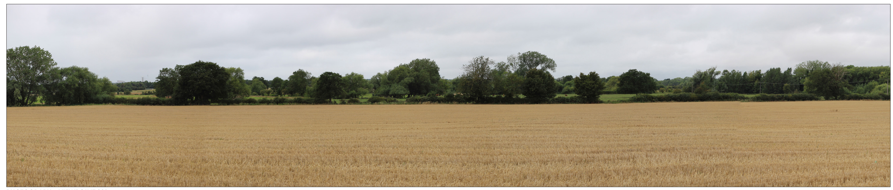
PHOTOGRAPH - VIEWPOINT $31

VIEW LOOKING WEST TOWARDS HEDGEROW FORMING PART OF THE SITE'S NORTH-WESTERN BOUNDARY, BEYOND THIS BOUNDARY VEGETATION ALONGSIDE THE RIVER OUZEL IS VISIBLE.