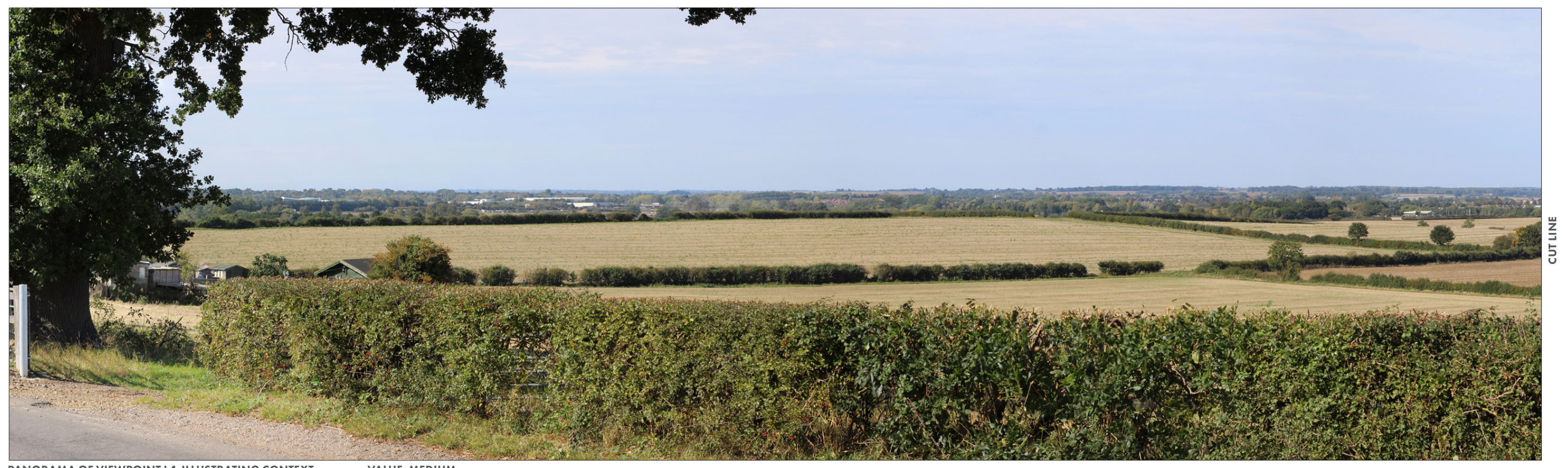
PANORAMA OF VIEWPOINT L4 ILLUSTRATING CONTEXT VALUE: MEDIUM VIEW NORTH-WEST WHERE FOOTPATH 4 JOINS NEWPORT ROAD IN MOULSOE. OPEN VIEWS EXTEND OVER THE MOULSOE BOWL TO THE EAST FACING SLOPES OF THE MOULSOE RIDGE WITHIN THE SITE. DISTANT VIEWS EXTEND TO THE ROOFTOPS OF SETTLEMENT AND AN OPEN SKYLINE OF WOODLAND AND ARABLE FIELDS. DISTANT VIEWS INCLUDE THE TOWER OF GRADE IST PETER AND ST PAUL CHURCH IN NEWPORT PAGNELL, FRAMED BY THE TOPOGRAPHY OF THE MOULSOE GAP.