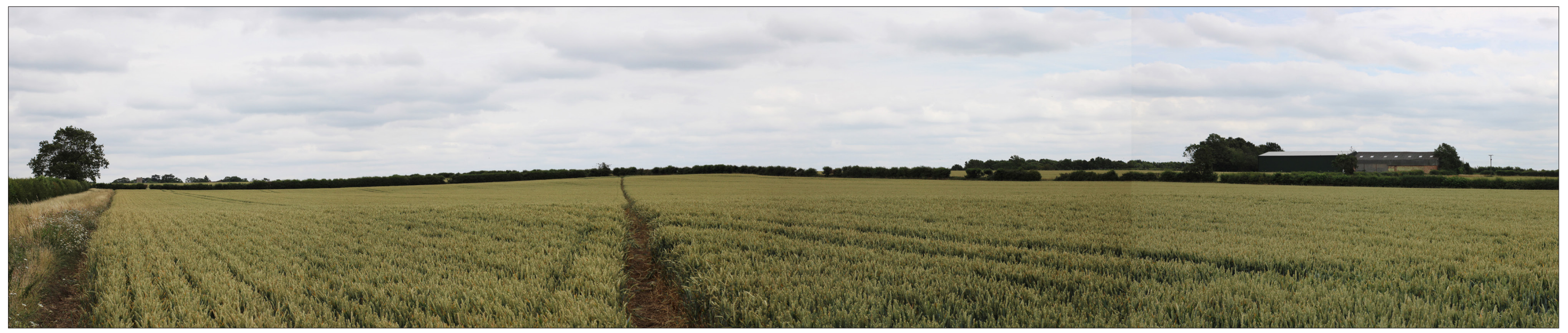
PHOTOGRAPH - VIEWPOINT $16 VALUE: MEDIUM

VIEW LOOKING EAST FROM FOOTPATH 2 THAT EXTENDS FROM THE A509 LONDON ROAD TO NEWPORT ROAD. SLOPING ARABLE FIELDS DOMINATE THE VIEW. TO THE LEFT OF THE PANORAMA THE TOWER OF ST. MARY'S CHURCH IS SEEN BEYOND THE MOULSOE RIDGE (WITHIN THE SITE). RIGHT OF THE VIEW. ARE FARM BUILDINGS/ STORAGE SHEDS ALONGSIDE NEWPORT ROAD.