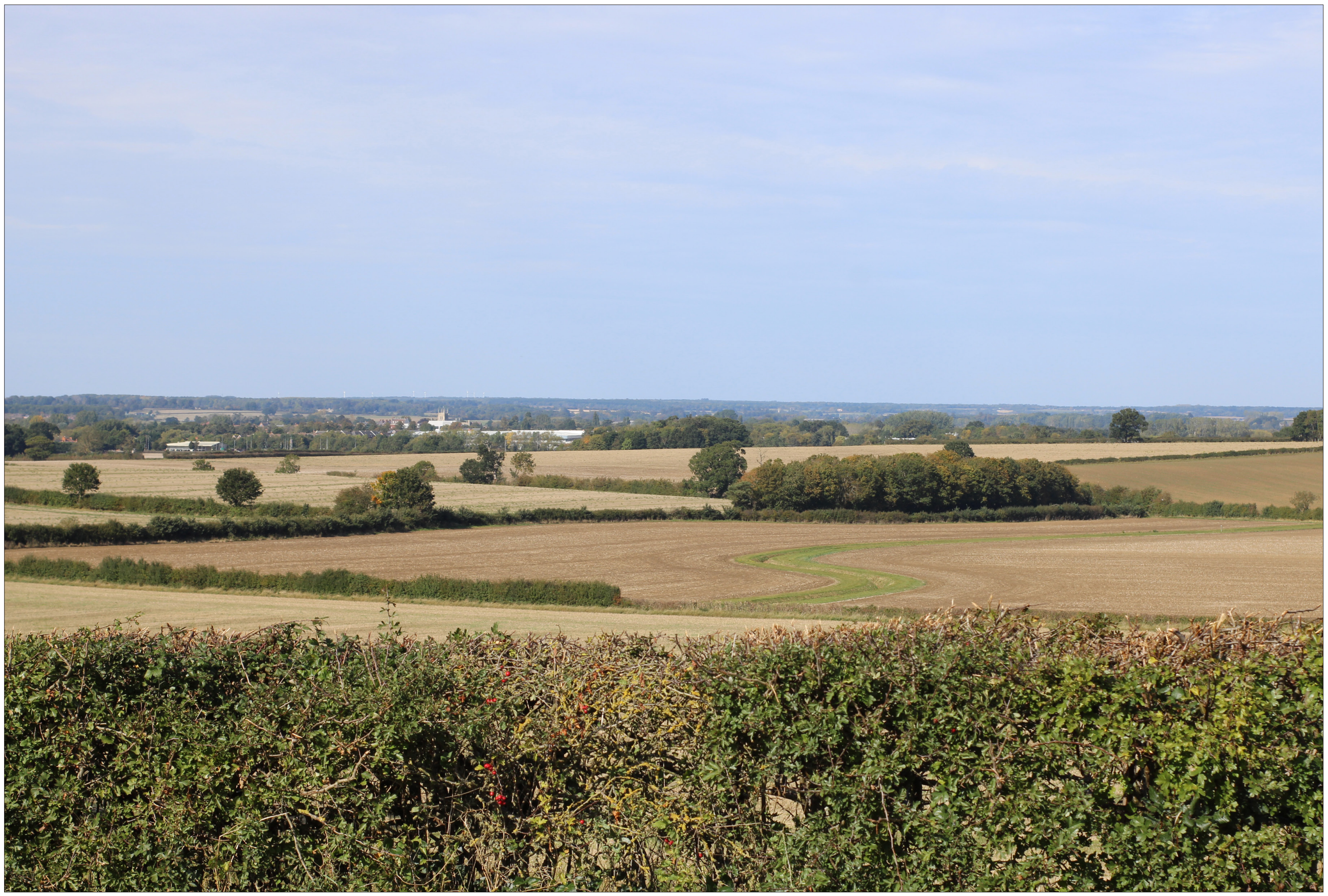
PHOTOGRAPH - VIEWPOINT L4