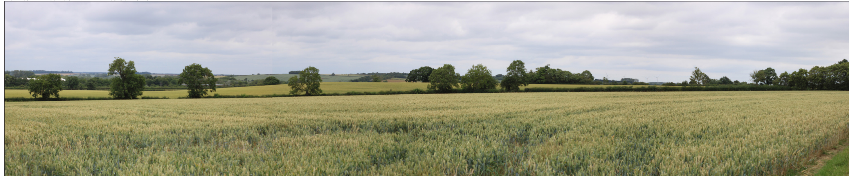
PHOTOGRAPH - VIEWPOINT $24 VALUE: MEDIUM

PHOTOGRAPH – VIEWPOINT 523 VALUE: MEDIUM VIEW LOOKING NORTH-EAST FROM FOOTPATH 17 THAT EXTENDS TO THE A509. ARABLE LAND RISING OVER THE TICKFORD RIDGE (RIGHT) DOMINATES THIS VIEW. BEYOND THE SITE THERE ARE MID DISTANT VIEWS OF VEGETATION ALONGSIDE THE A509 AND NORTH CRAWLEY ROAD BRIDGE (LEFT). IN THE DISTANCE THE A509 IS SEEN EXTENDING OVER CHICHLEY HILL.