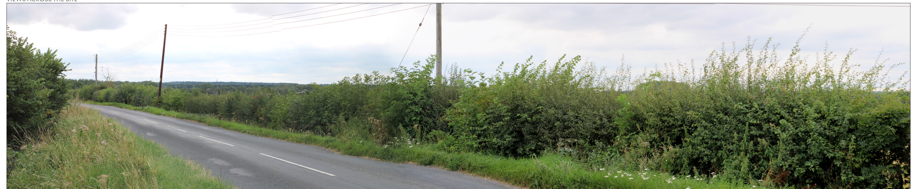
PHOTOGRAPH - VIEWPOINT S14 VALUE: LOW VIEWPOINT 14 LOOKING NORTH-WEST FROM NEWPORT ROAD. THE SITE IS GLIMPSED BEYOND ROADSIDE AND INTERNAL HEDGEROW WITH THE A509 EVIDENT IN THE MIDDLE DISTANCE.

PHOTOGRAPH – VIEWPOINT S13 VALUE: LOW VIEW LOOKING NORTH-WEST ALONG NEWPORT ROAD TOWARDS THE A509 JUNCTION THAT IS EVIDENT IN THE MIDDLE DISTANCE. HEDGEROWS DEFINED THE INTERNAL FIELD BOUNDARIES AND OBSCURE LOCALISED VIEWS ACROSS THE SITE. THE HEDGEROW THAT DEFINES THE A509 OBSCURE DISTANT VIEWS ACROSS THE SITE