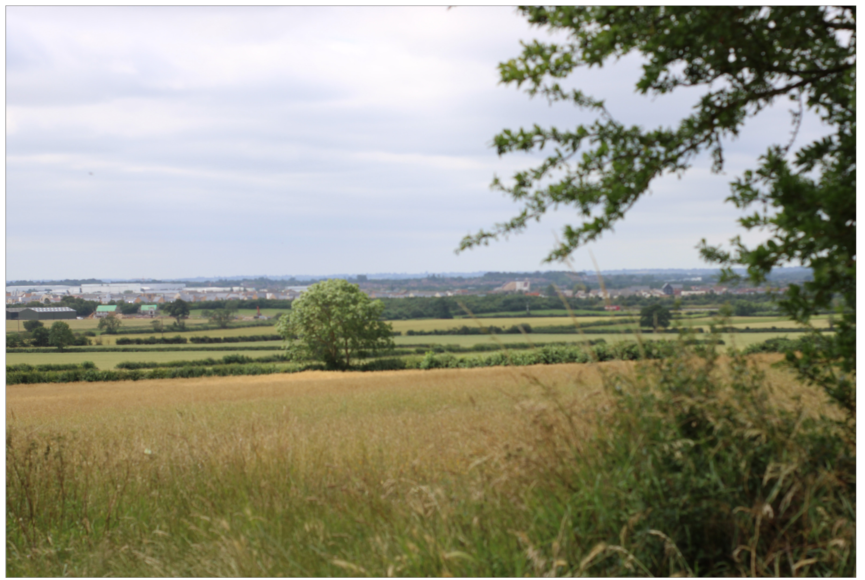
PHOTOGRAPH - VIEWPOINT L5