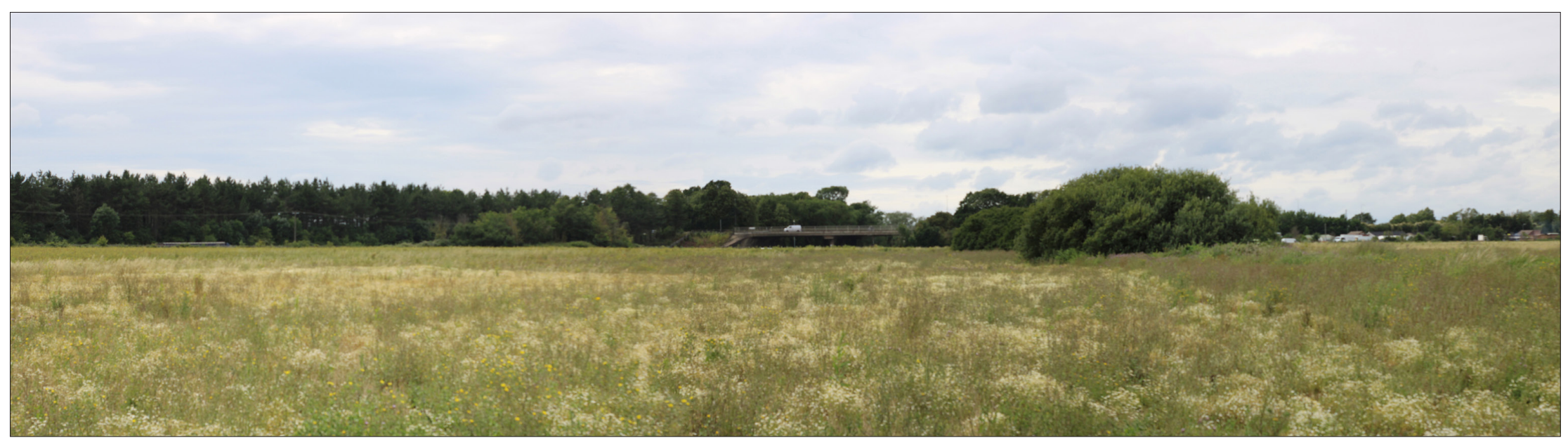
PHOTOGRAPH - VIEWPOINT $37 VALUE: LOW

VIEW LOOKING WEST TOWARDS THE SITE'S WESTERNMOST CORNER FROM FOOTPATH 14 THAT LINKS MILTON KEYNES AND NEWPORT PAGNELL. ROUGH GRASSLAND, RUDERALS AND SCRUB DOMINATES THIS FLAT FIELD. VIEWS EXTEND TO THE M1 CORRIDOR, WILLEN ROAD BRIDGE AND ADJACENT VEGETATION. PARAPHERNALIA ASSOCIATED WITH CALDECOT FARM IS SEEN TO THE RIGHT OF THE PHOTOGRAPH.