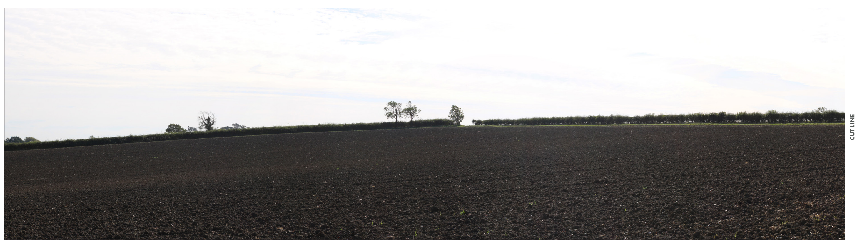
PANORAMA OF VIEWPOINT L1 ILLUSTRATING CONTEXT VALUE: MEDIUM VIEW SOUTH ON BRIDLEWAY 3, WHICH CONNECTS NORTH CRAWLEY ROAD WITH MOULSOE. ARABLE LAND RISES TO HEDGEROW AND FOOTPATH 19, WHICH EXTENDS ALONG THE TICKFORD RIDGE. THE SITE'S NORTH-EASTERN CORNER IS GLIMPSED