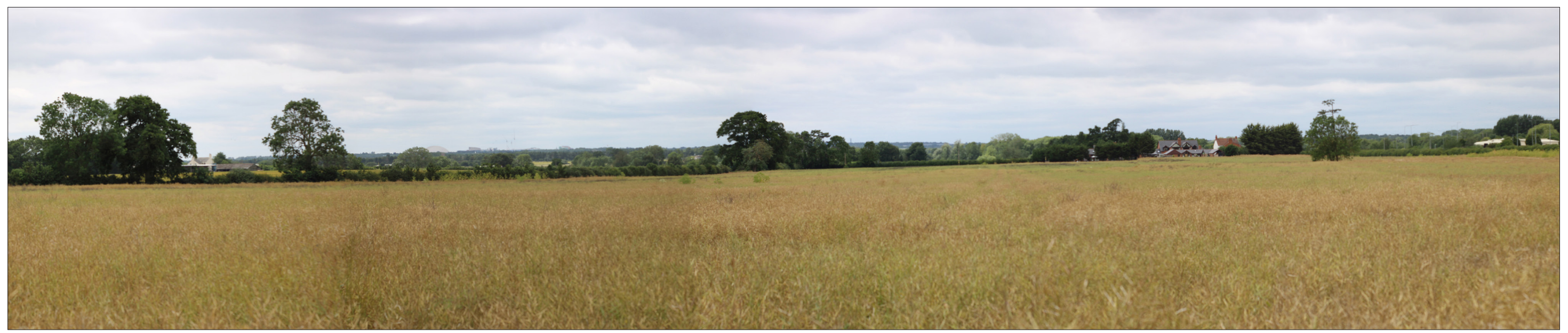
PHOTOGRAPH - VIEWPOINT $22 VALUE: MEDIUM

VIEW LOOKING SOUTH-WEST FROM FOOTPATH 17 THAT EXTENDS TO THE A509. MIDDLE DISTANT VIEWS EXTEND TO NEWPORT STABLES AT THE A509/A422 JUNCTION (RIGHT) AND FARM COTTAGES ON THE A509 (LEFT). THE MILTON KEYNES SNOWDOME AND SKYLINE IS SEEN IN THE FAR DISTANCE.