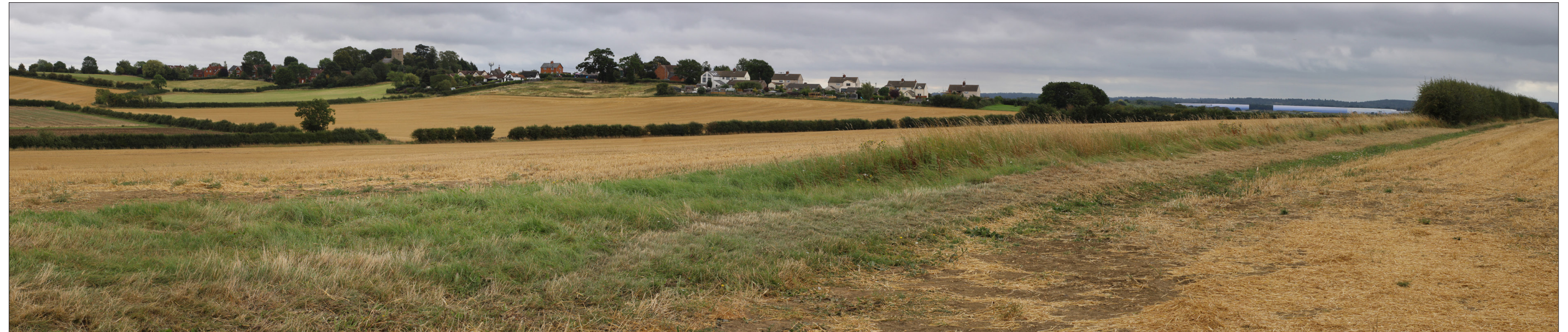
PHOTOGRAPH - VIEWPOINT $27

VIEW LOOKING SOUTH-EAST FROM THE TOP OF THE MOULSOE RIDGE WITHIN THE SITE. FROM THIS ELEVATED POSITION VIEWS EXTEND OVER THE MOULSOE BOWL TO MOULSOE VILLAGE. DISTRIBUTION SHEDS ARE VISIBLE TO THE RIGHT..