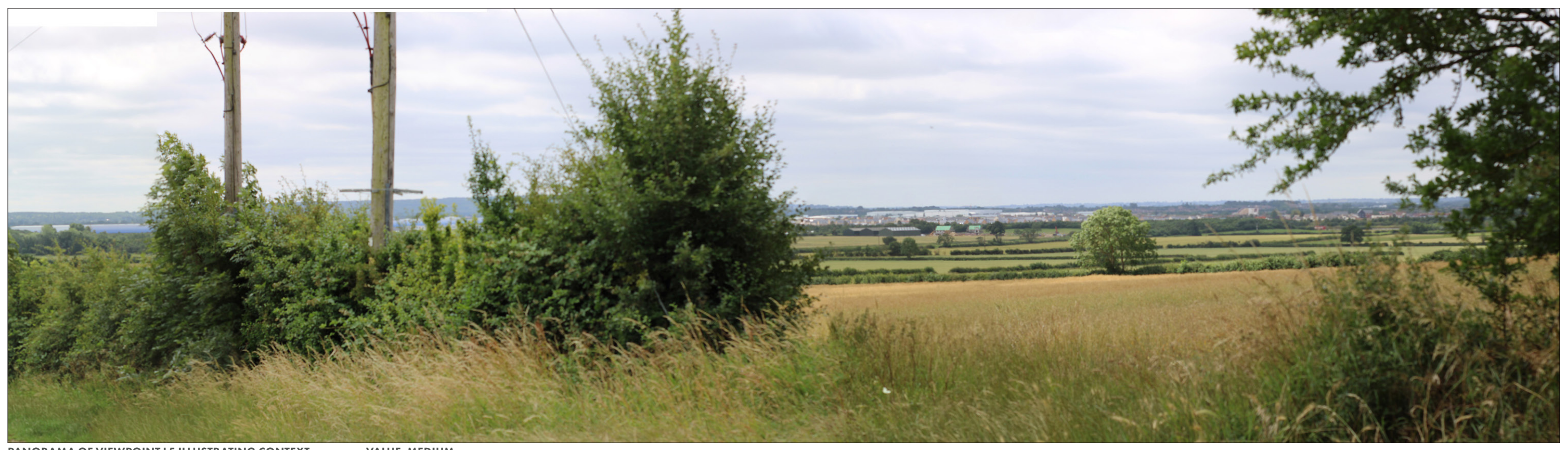
PANORAMA OF VIEWPOINT L5 ILLUSTRATING CONTEXT VALUE: MEDIUM VIEW SOUTH FROM FOOTPATH 5, WHICH CONNECTS MOULSOE WITH BROUGHTON GROUNDS COMMUNITY WOODS. THE SITE'S SOUTH-EASTERN FIELDS ARE SEEN BEYOND ADJACENT HEDGEROW AND AN ARABLE FIELD. THE EASTERN EXPANSION OF MILTON KEYNES IS SEEN IN THE FAR DISTANCE.