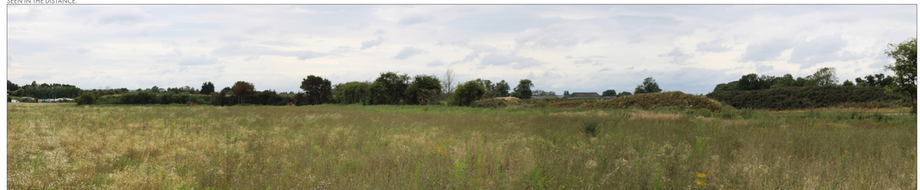
PHOTOGRAPH - VIEWPOINT $39 VALUE: LOW

PHOTOGRAPH - VIEWPOINT S38 VALUE: MEDIUM VIEW LOOKING EAST OVER THE OUZEL VALLEY FLOOR FROM FOOTPATH 14 THAT LINKS MILTON KEYNES AND NEWPORT PAGNELL. A FLAT FIELD OF ROUGH GRASSLAND, RUDERALS AND SCRUB DOMINATES THE FOREGROUND. THE SITE'S WEST FACING SLOPES AND SKYLINE VIEWS OF ST. MARY'S CHURCH ARE SEEN IN THE DISTANCE.