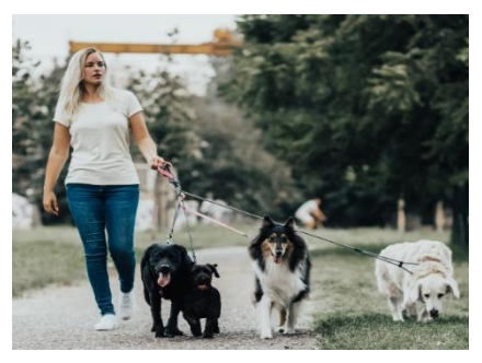
○ Dog walker